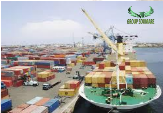
SHIPPING Location: Seaport of Conakry Guinea