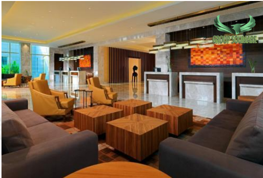
INTERIOR RENOVATION Location: Sheraton Grand - Reception Conakry, Guinea