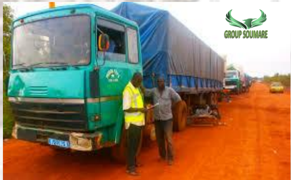
TRANSPORTATION Location: Conakry Guinea