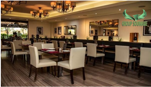
CAFETERIA Location: Avenue Restaurant Conakry - Guinea