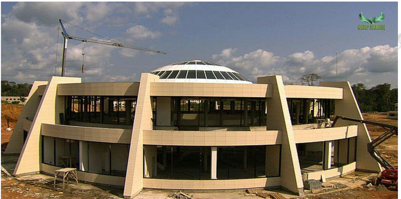
National Theater, Conakry Guinea