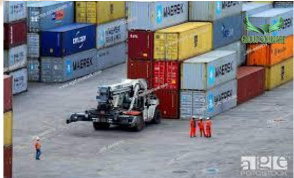
TRANSIT Location: Containers at the seaport of Conakry Guinea