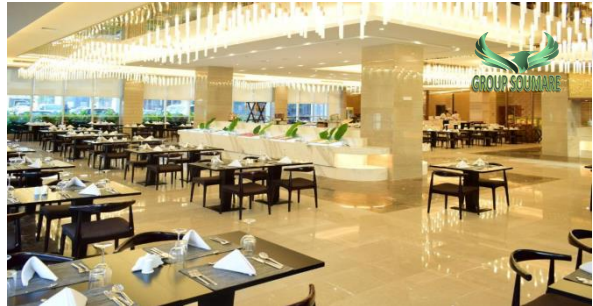
INTERIOR RENOVATION Location: Hotel Conakry – Reception Conakry, Guinea